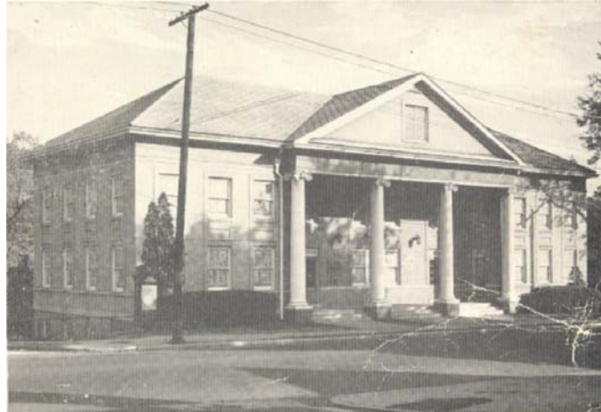
Church, St. Elmo, Tenn.